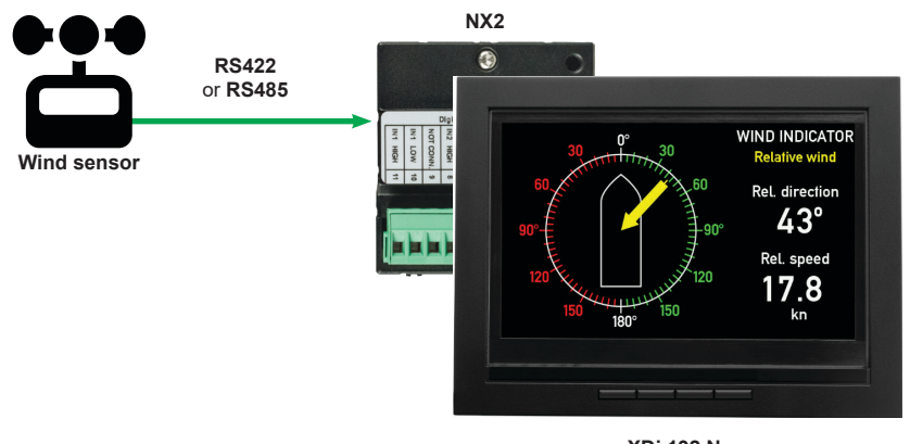
XDi 192 N with DEIF standard wind indicator library

The RS422 or RS485 port on the XDi is used to receive NMEA 0183 data from the wind sensor